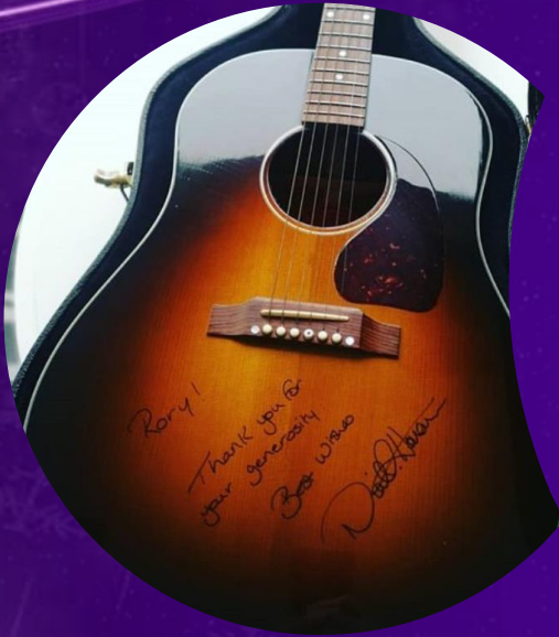
Donated by Pop-Star