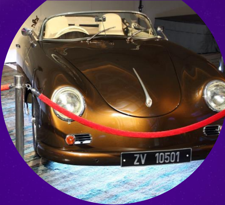
Donated by Core Capital