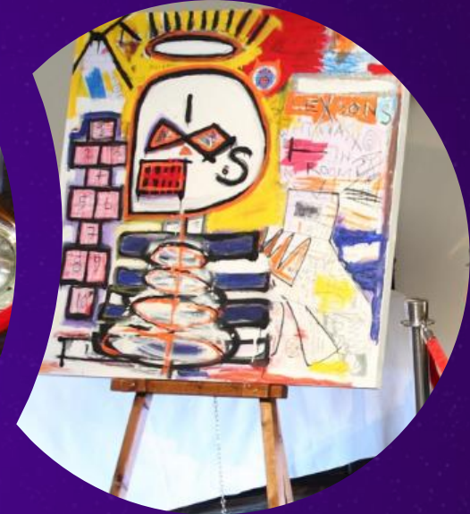
Donated by Artist